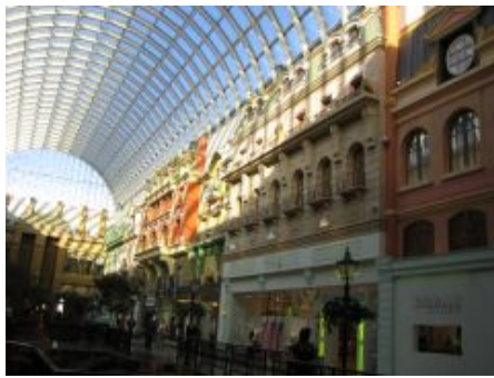
(a) Asia personas duo