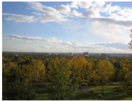
(b) Pan ma signo