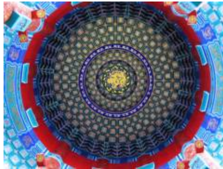
(d) Titulo debitas